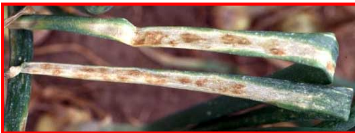
Figure 4: A. Downy mildew ( Peronospora destructor )

Control: The control for both diseases is similar. They can be controlled by keeping foliage dry. Fields should be monitored closely, particularly during prolonged cold, wet weather, when the disease is more likely to occur. Fungicides that are highly effective against downy mildew, such as Ridomil and Aliette, should be applied following the first report of downy mildew in the growing area. Use surface or buried drip or T-tape especially in crop's late stage.