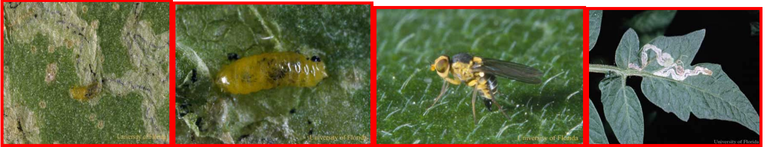
Figures 2: A. Larva in mine

Damage: The first larval stage of the leafminer burrows into the centre of the leaf (mesophyll) tissue. The second stage also feeds in the mesophyll tissue. The third stage larva concentrates its feeding towards the upper leaf surface. When it is mature, it cuts a longitudinal slit in the leaf and leaves to pupate on the leaf surface or on the ground. The larval leaf mine is long, narrow and not greatly widening towards the end on large leaf surfaces (Figure 2D). Larval mines in small leaves with limited feeding space is characterized by a secondary blotch. Damage caused by a single larva is minimal, however when large populations are present they are capable of destroying leaves and affecting the growth of plants.