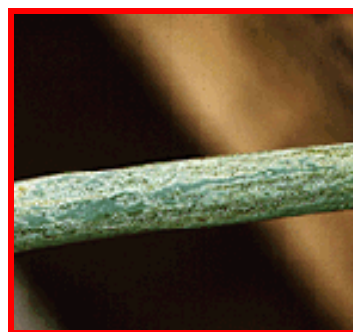
Figures 1: A. Onion thrips (nymph) B. Onion thrips (Adult) C. Damage by onion thrips