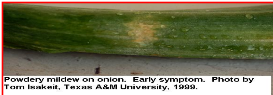
Powdery mildew on onion. Early symptom.