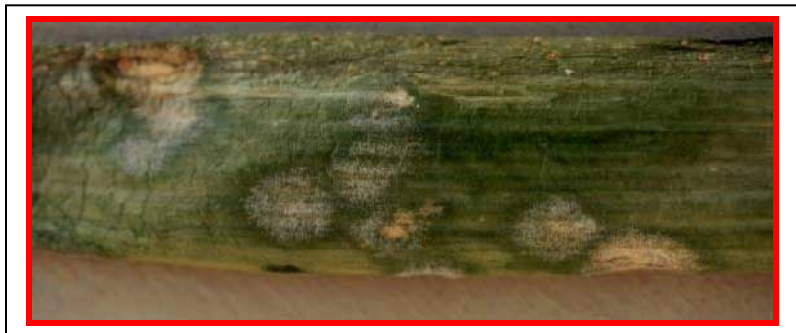
Figure 6: A. Powdery mildew ( Leveillula taurica )

Control: Fungicides used to control purple blotch will also control this disease.