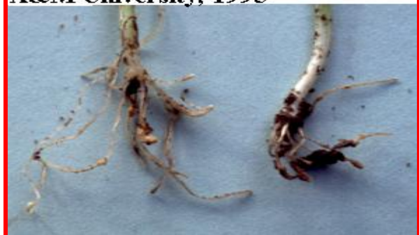
Figure 7: Root Knot Nematode Galls

Onion: Root knot nematode galls.