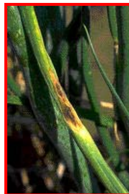
B. Stemphyllium Blight ( Stemphyllium vesicarium )