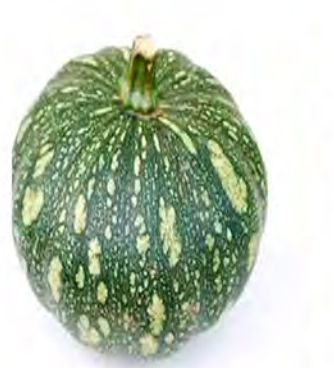
Pumpkin ( Cucurbita pepo )