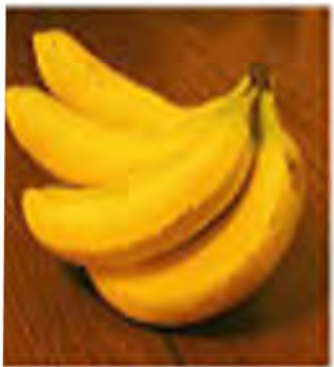
Banana / Plantain ( Musa spp. )