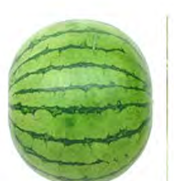
Watermelon ( Citrullus lanatus )