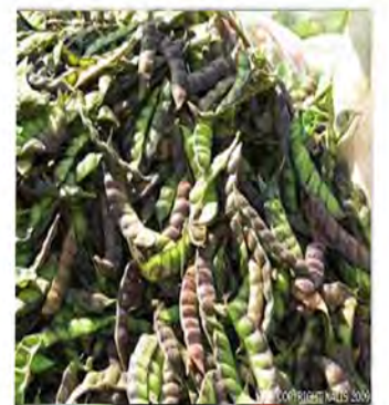
Peas, Pigeon ( Cajanus cajan ) NA (pod), ALL