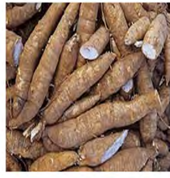
Cassava ( Manihot esculenta )