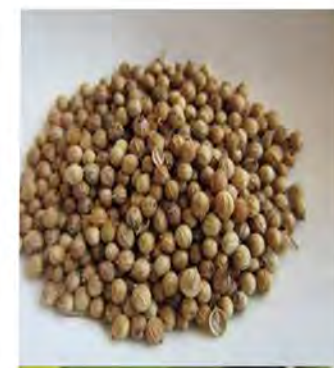
Coriander ( Coriandrum sativum )