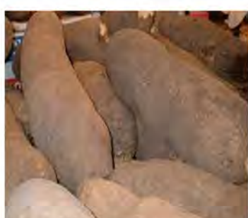
Yam ( Dioscorea spp. ) Treatment T101-f-3

And such cut flowers as: Alpinia purpurata (red ginger), Anthurium spp. (anthurium), Codiaeum variegatum (croton leaves), Cordyline terminalis (ti leaves), Cyperus spp. (papyrus), Dracaena spp. (dracaena), Gerbera spp. (gerbera), Gladiolus spp. (gladiolus), Heliconia spp. (heliconia), Orchidaceae spp. (orchid), Pandanus spp. (pandanus), Phaeomeria speciosa (torch ginger), Rosa spp. (roses), Rumohra adiantiformis (leather leaf fern), Strelitzia reginae (bird-of paradise).