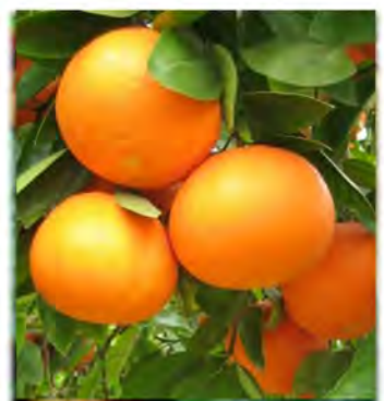
Citrus, Ortanique ( Citrus putative ) NA, SAG, NP