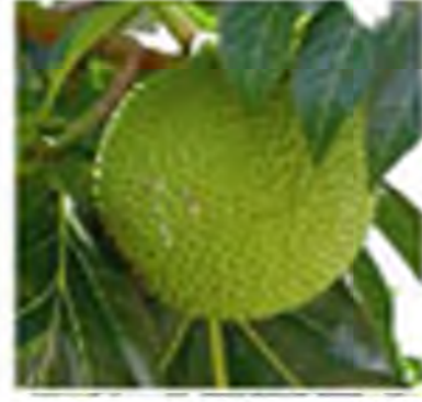
Breadfruit ( Artocarpus altilis )