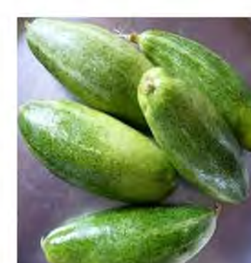
Pointed Gourd ( Trichosanthes dioica )