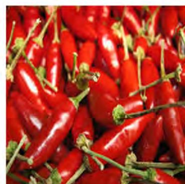
Pepper, Chili ( Capsicum sp. ) Treatment T104-a-2