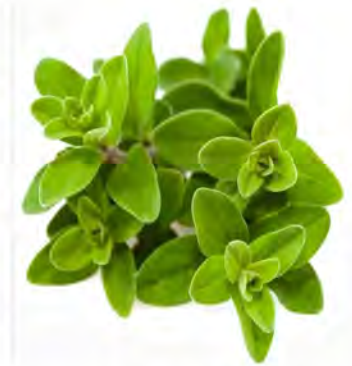
Marjoram ( Origanum majorana )