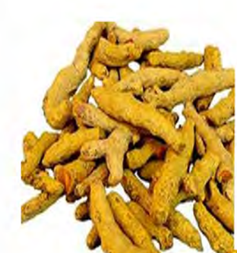
Turmeric ( Curcuma longa )