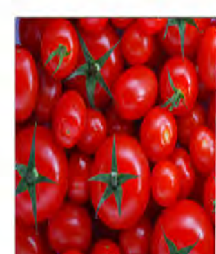
Tomato ( Lycopersicon esculentum )