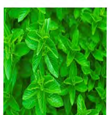
Spearmint ( Mentha spicata )