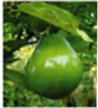
Avocado ( Persea americana ) NA, SAG, NP.