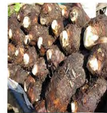
Dasheen ( Colocasia esculenta )