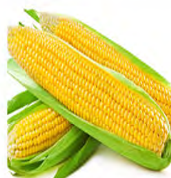
Sweet Corn ( Zea mays )