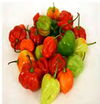
Pepper, Scotch Bonnet ( Capsicum chinense ) Treatment T104-a-2