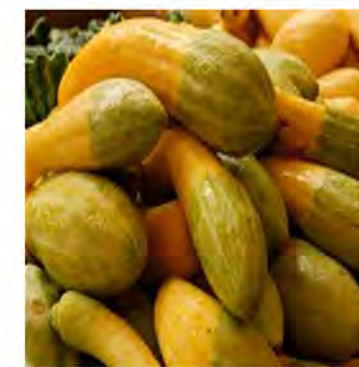
Squash (incl. Zucchini) ( Curcubita maxima )