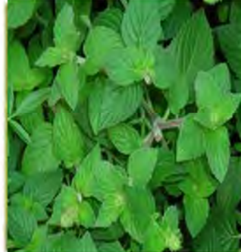
Oregano ( Origanum vulgare )