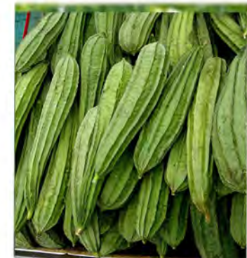
Chinese Okra ( Luffa sp. )