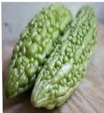
Bitter Melon ( Momordica charantia )