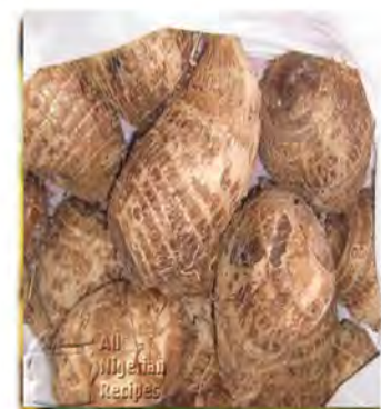
Coco Yam ( Xanthosoma sagittifolium )