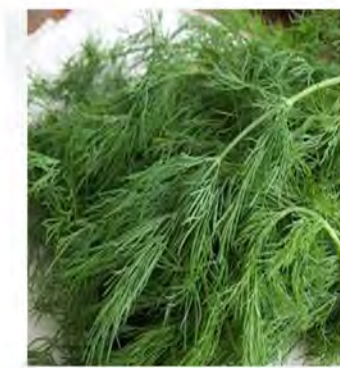
Dill ( Anethum graveolens )