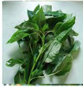
Callaloo ( Amaranthus sp. )