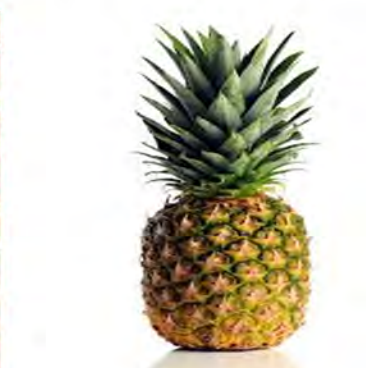
Pineapple ( Ananas cosmosus ) Prohibited into Hawaii