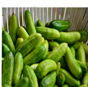
Tindora ( Coccinia grandis )