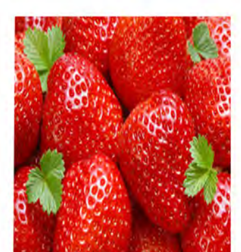
Strawberry ( Frageria sp. )