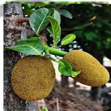
Jackfruit ( Artocarpus heterophyllus )