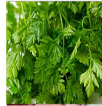
Chervi ( Anthriscus cerefolium )