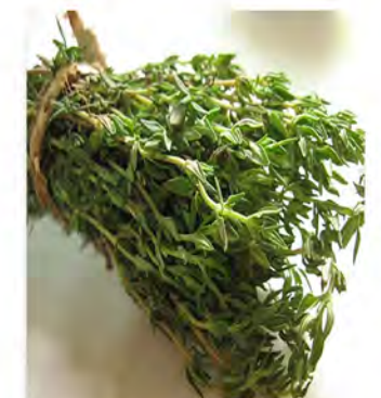
Thyme ( Thymus vulgaris ) Treatment T101-n-2