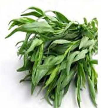
Tarragon ( Artemisia dracunculul )