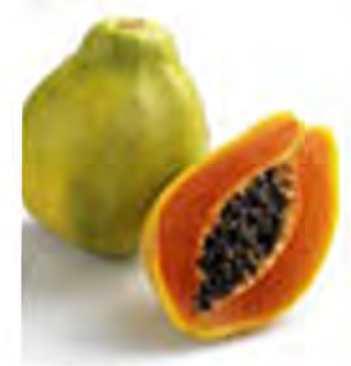
Papaya ( Carica papaya ) Prohibited into Hawaii