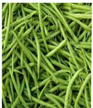
String Beans ( Phaseolus vulgaris )