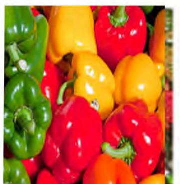
Pepper, Sweet ( Capsicum annuum ) Treatment T104-a-2