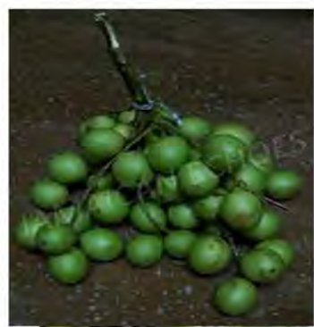
Guinep ( Melicoccus bijugatus ) NA, SAG