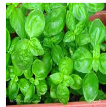
Sweet Basil ( Ocinum basilicum )