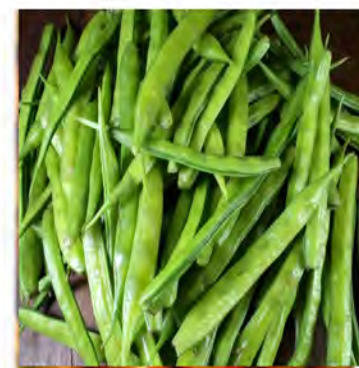
Cluster Beans ( Cyomopsis tetragonoloba )