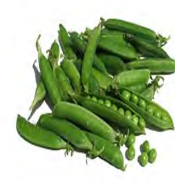
Peas, Garden ( Pisum sativum ) NA, SAG, NP