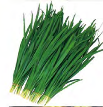
Chives ( Allium schoenoprasum )