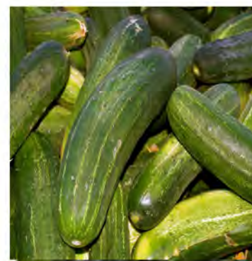
Cucumber ( Cucumis sativa )