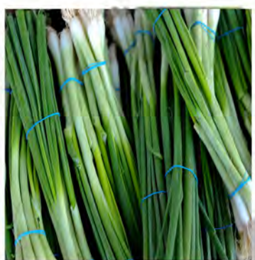
Escallion ( Allium sp. )