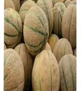
Melons, Cantlps ( Cucumis melo )