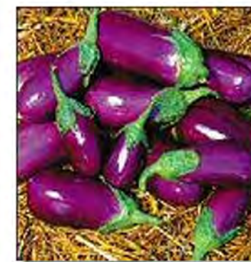
Eggplant ( Solanum melogena )