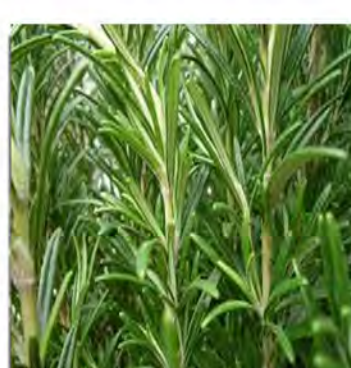
Rosemary ( Rosmarinus officinalis )