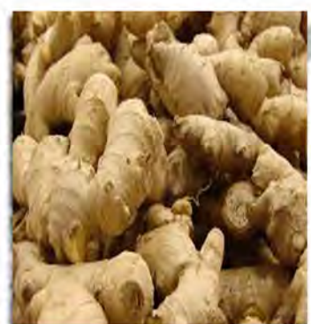
Ginger, Rhizome ( Zingiber officinale )