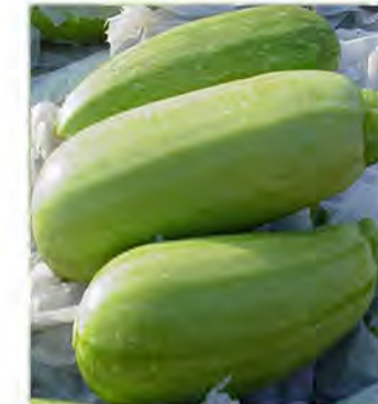
Chinese Melon ( Benicasa hispida )