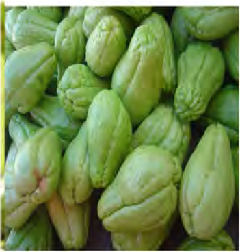
Cho Cho, Chayote ( Sechium edule )