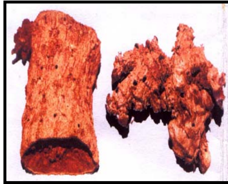
Figure 2: Damage caused by yam weevil to yam tuber ( Dioscorea sp.) and ginger rhizomes ( Zingiber officinale )

the most damage, as they will chew on the interior of the yam tissues starting from near the cortex after hatching to the center of the yam as they mature. Many tunnels are created by the larvae, becoming larger as the larva matures. The yam tissues then become dark brown as the tissues are predisposed to infection from pathogens. Pupation takes place near the yam surface; the emerging adults chew their way out creating holes 2 mm wide